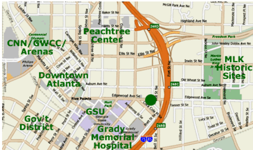
Overview of Our Location in Downtown Atlanta

The market is located on the eastern side of Downtown Atlanta, adjacent to I-75/85 and right by Georgia State University, Grady Memorial Hospital, and the historic Auburn Ave. / MLK district.